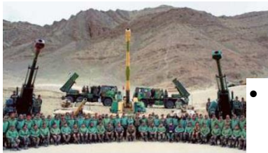
Army chief Gen. Manoj Pande visiting Ladakh and witnessing Exercise Parvat Prahara on Saturday.

Army chief General Manoj Pande visited the Ladakh sector to review Exercise Parvat Prahara. The exercise saw the deployment of all new major inductions of the Army.