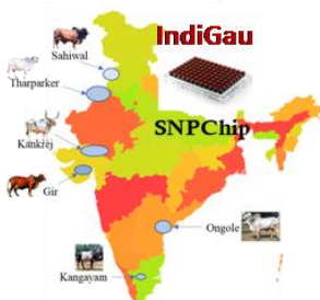
Conservation of cows

Dr Jitendra Singh today released ‘ IndiGau ’ chip. It is India’s first Cattle Genomic Chip for the conservation of pure varieties of indigenous cattle breeds like, Gir, Kankrej, Sahiwal, Ongole etc. IndiGau chip has been developed by scientists of National Institute of Animal Biotechnology (NAIB), Hyderabad , an autonomous institution under the aegis of the Department of Biotechnology. The chip will help in achieving the goal of conservation of our own breeds with