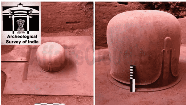
Nam Province, Vietnam .

On May 27, 2020, A 4-member team of Archaeological Survey of India (ASI) has discovered a 1100-year-old monolithic sandstone Shiva lingam , a representation of the Hindu deity Shiva, at the Cham Temple Complex located in My Son Sanctuary of Quang