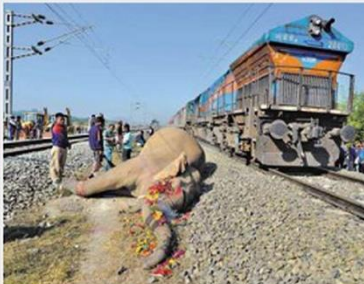
Death on the tracks: The carcass of one of the two tuskers run over by a train at Moinajan in Kamrup (Metro) district of Assam on Wednesday. Local people say the elephants entered the village to feed on paddy.

About: While electrocution claimed the lives of 741 elephants, train hits led to the death of 186 pachyderms, followed by poaching (169) and poisoning (64), a document accessed from the Ministry through the Right to Information (RTI) Act revealed. Karnataka and Odisha lost 133 elephants each to electrocution during the period and Assam reported 129 deaths.