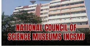
NATIONAL COUNCIL OF SCIENCE MUSEUMS (NCSM)