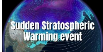
Sudden Stratospheric Warming event