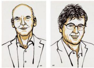
Benjamin List Prize share: 1/2